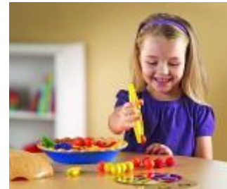
Super Sorting Pie

One of the all time favorite tools for educators and therapists. Users try to match 1 of 10 different patterns by stacking brightly colored beads on wooden dowels.